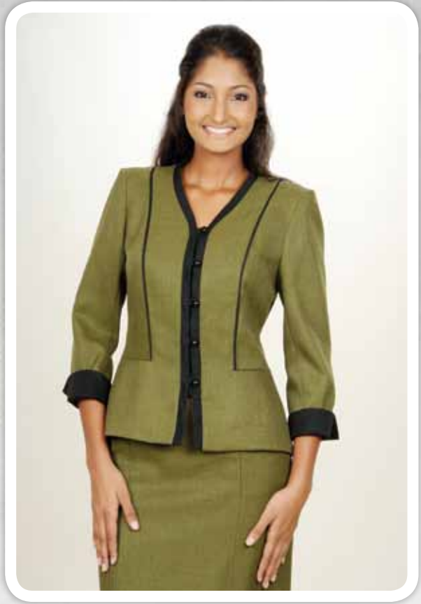
In the loop